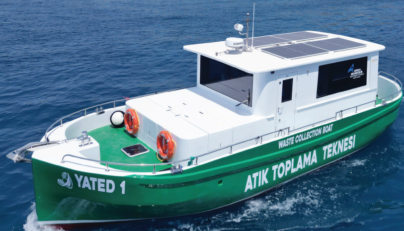
YATED 1 LIQUID WASTE COLLECTION VESSEL